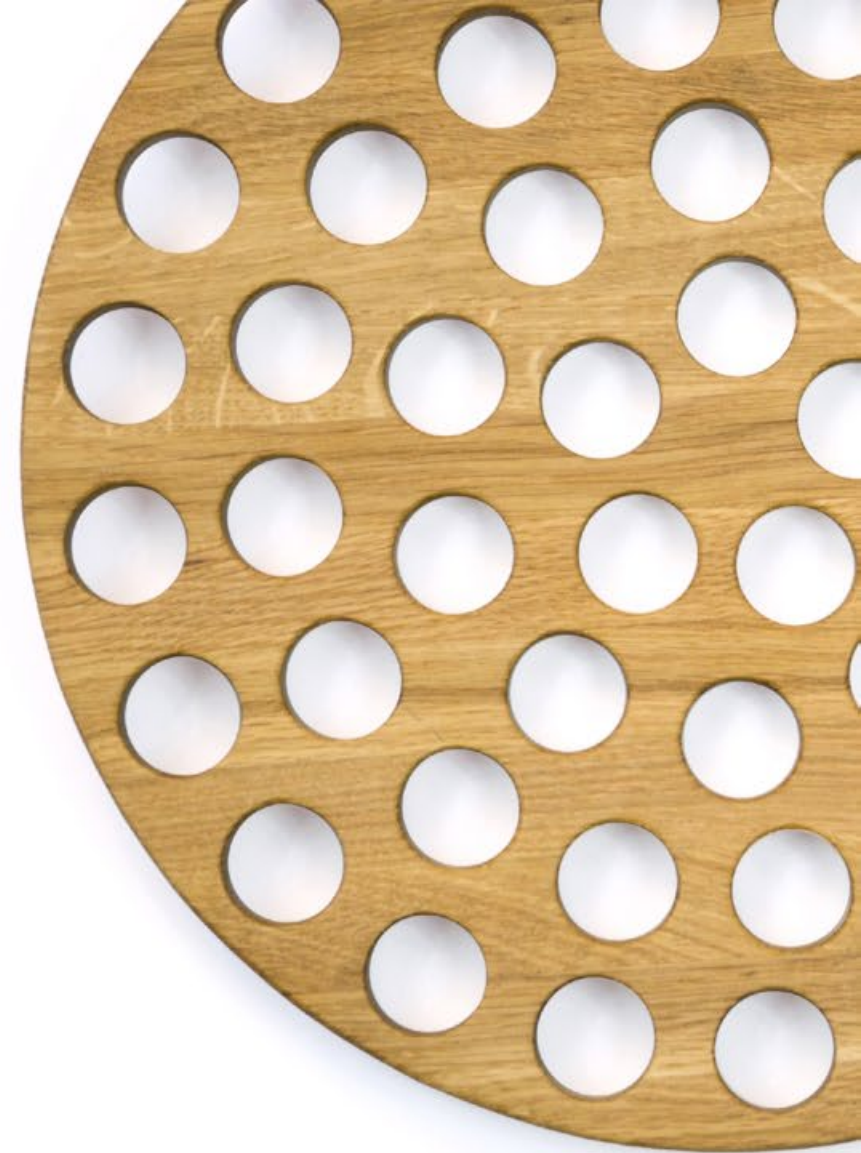
geo fruit bowl 360 solid oak presentation platter